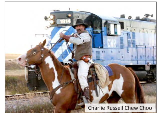
Charlie Russell Chew Choo