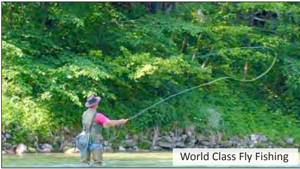
World Class Fly Fishing