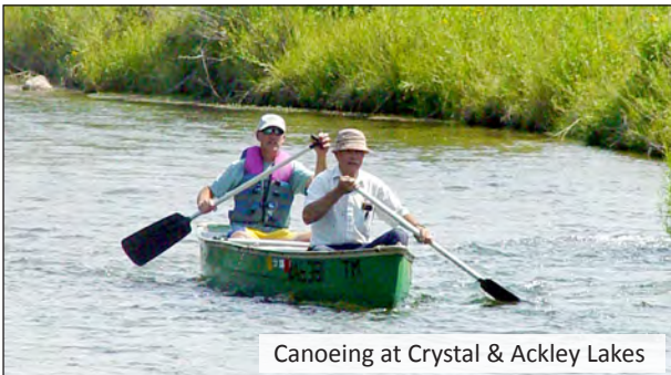
Canoeing at Crystal & Ackley Lakes

Funding provided by Lewistown Hoteliers Tourism Business Improvement District (TBID)