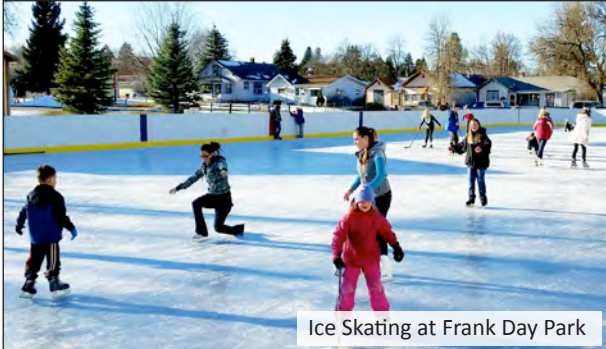
Ice Skating at Frank Day Park