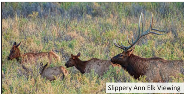
Slippery Ann Elk Viewing