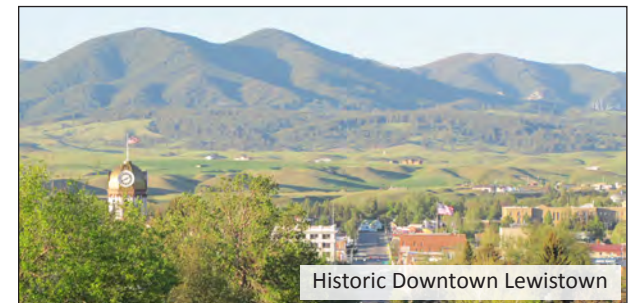
Historic Downtown Lewistown